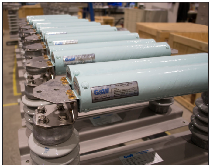
▲ G&W's High Current Limiters.

APPLICATION: A primary application of this fuse is expected to be in substations where their auxiliary power is derived from the tertiary winding of a large power transformer. Fault currents are often in excess of 60kA. While most commercially available current limiting fuses are limited to 50kA. Continuous currents are commonly in the 5 to 20 ampere continuous range or well within the range of the shunt fuse alone. Although tertiary windings are the most common applications, it can be used in other circuits with high fault currents and low continuous currents.