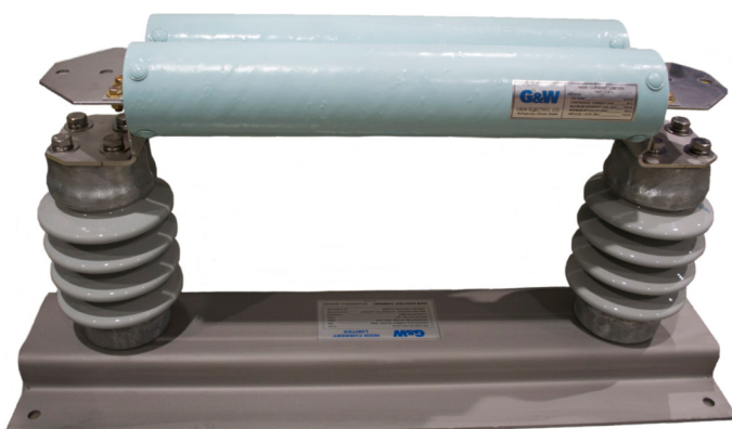
◀ 50A High Current Limiter.

MOUNTING: Fuse mounting is simple with bolted bracket mount. It is placed in series with the protected device. Mounting supports can be provided by G&W Electric.