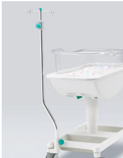
Atom's code: 26113 I.V Pole for Neo Cot