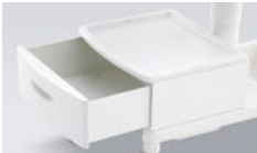
Opening the drawer