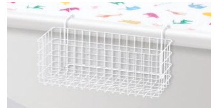
Atom's code: 26117 Basket for Neo Cot