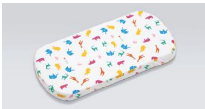
Atom's code: 26118 Mattress for Neo Cot