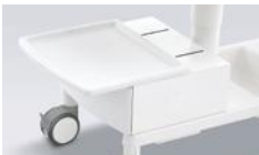
Sliding open the top slide tray

Pulse oximeter can be put on the slide tray which is suitable for practical use.