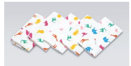
Atom's code: 26122 Mattress Sheet for Neo Cot (5 pcs/pkg)