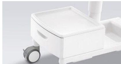
Atom's code: 26114 Drawer for Neo Cot