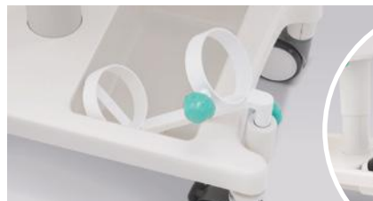
Atom's code: 26411 Cylinder Rack for Neo Cot