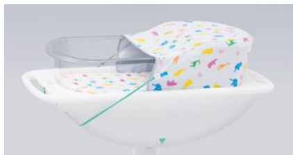
Atom's code: 26123 Shade for Neo Cot