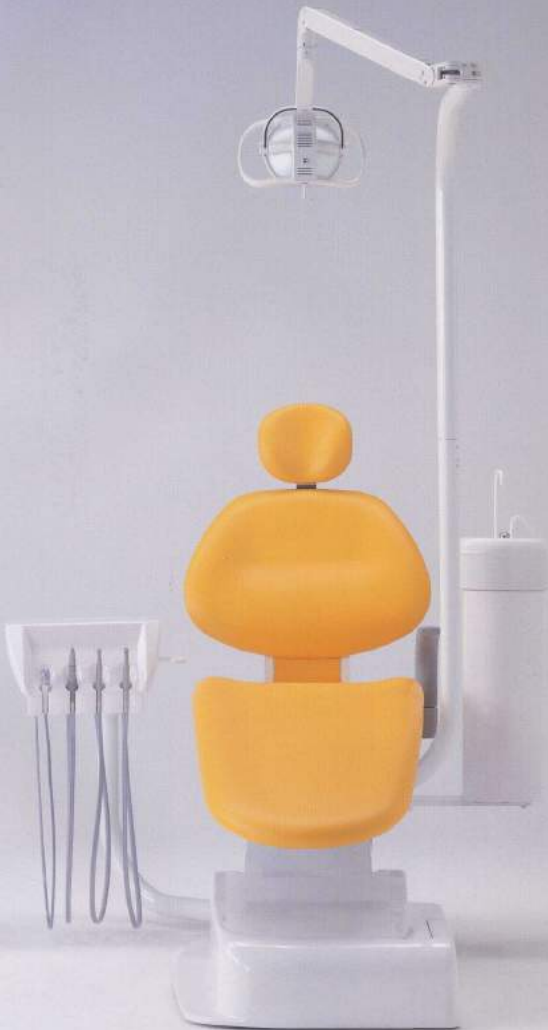
Clean Water System (Option)